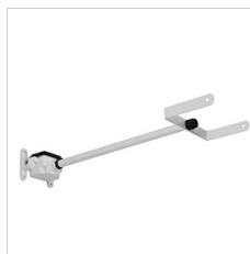
14463485 1000 mm arm completes with connection base GUELL ZERO