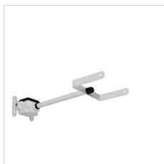
14463585 500 mm arm completes with connection base GUELL ZERO